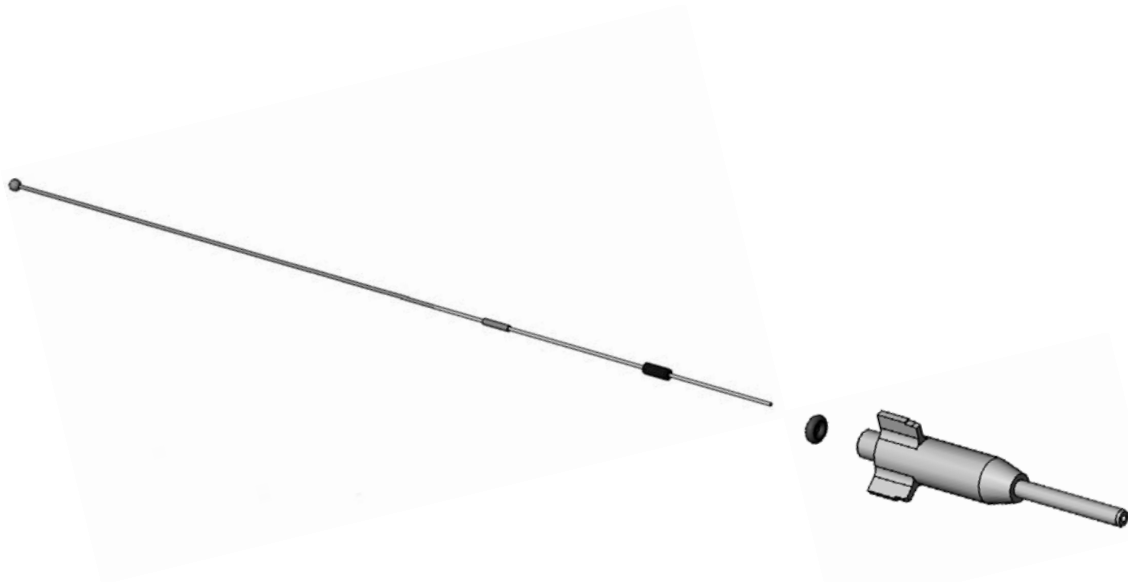
Figure 2 Encore Lance Extension Electrode and Sleeve Kit (150 mm Version Shown)