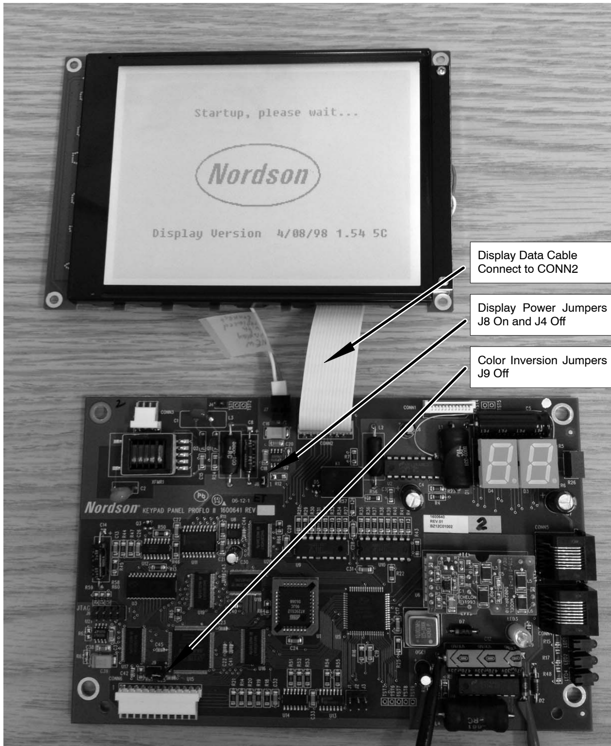
Figure 1 New QVGA Display with New Keypad PCA (Service Kit 1604376)